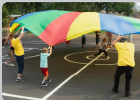
A group of campers raise a parachute together, a favorite activity at Camp Noah.

Thanks in part to your support of the 2017 wildfires, 70 grade school children who lived through the October 2017 wildfires attended Camp Noah in Sonoma and Mendocino counties this summer. This specially-designed day camp, created by LSS of Minnesota, helps children who are victims of disaster learn resiliency and preparedness skills.