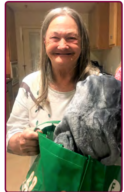
Adult residents in our inland programs received a warm robe at Christmas this year thanks to generous donors

Church of the Resurrection, Granite Bay Holy Cross, Concord St. James Lutheran, Redding St. Peter's Lutheran, Elk Grove Trinity Lutheran, Pleasanton Trinity Lutheran, Sacramento